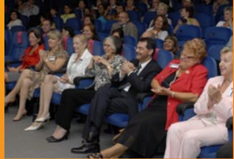
The old and new board members.