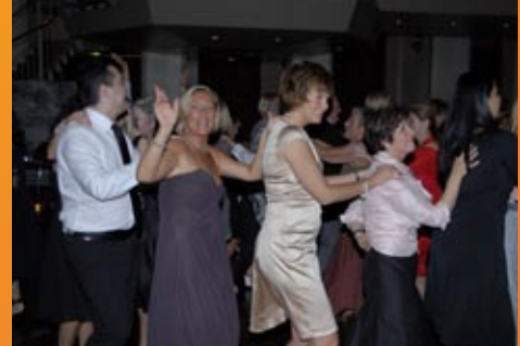
The famous CIDESCO conga line.